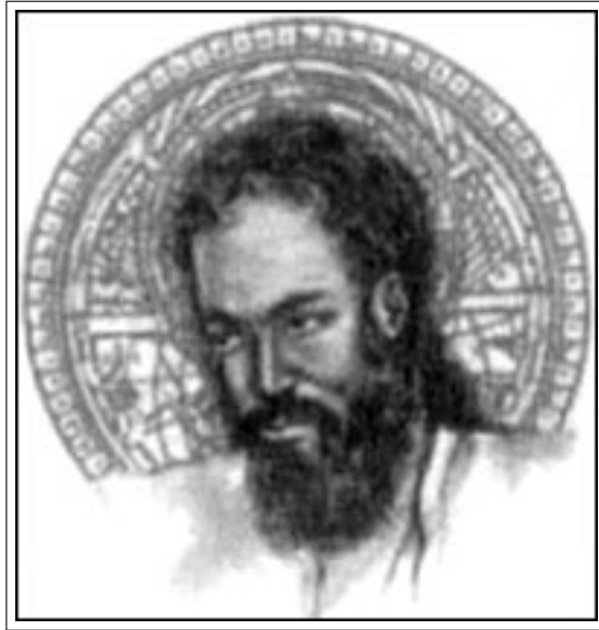
Figure 1: Ghyath al-Din Jamshid Kashani

The situation changed for the better when Timur died in 1405, and his son, Shah Rokh, ascended into power. Shah Rokh and his wife, Goharshad, a Persian princess, were very interested in the sciences, and they encouraged their court to study the various fields in great depth. Their son, Ulugh Beg, was enthusiastic about science as well, and made some noted contributions in mathematics and astronomy himself. Consequently, the period of their power became one of many scholarly accomplishments. This was the perfect environment for al-Kashi to begin his career as one of the world's greatest mathematicians.